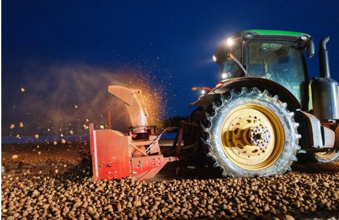
Photo 11: Potato Destruction via snowblower during the 2021 PEI Potato Wart Crisis