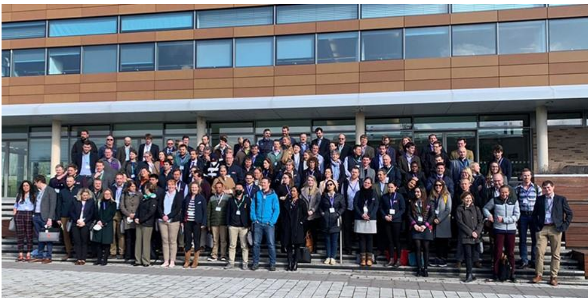
Photo 5: 2022 Contemporary Scholars

The annual Nuffield Contemporary Scholars Conference (CSC) was held in Norwich, UK, from March 7 to 15, 2022, under the theme 'Food, Climate and Health'. The conference provided an opportunity to meet with scholars from the current year. It was an excellent opportunity to network and learn about agriculture-related issues and innovations in the UK and worldwide. The conference gathered over 150 scholars from 15 countries, including Canada, Ireland, Brazil, Kenya, Zimbabwe, the Netherlands, France, Japan, the US, Australia, New Zealand, the UK, and Paraguay.