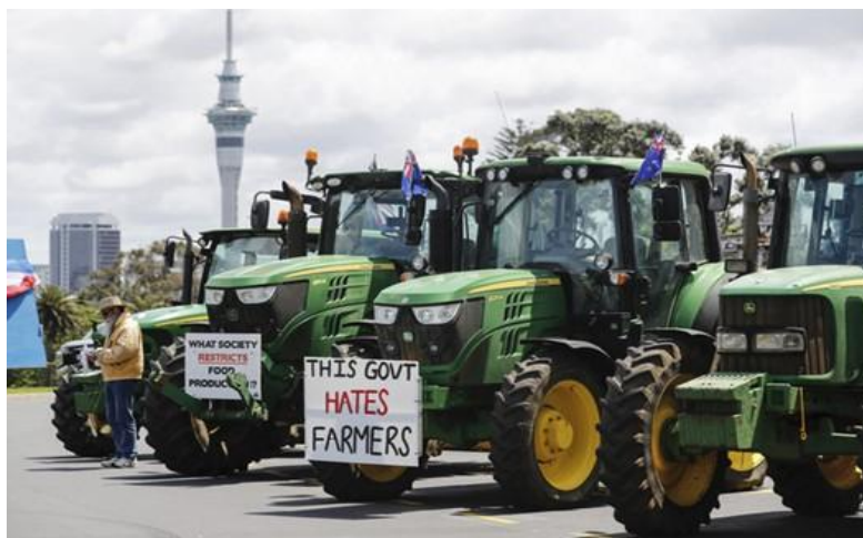
Photo 22: New Zealand Farmers protest environmental regulations

Ireland and New Zealand's governments increasingly recognize the need to balance economic growth with environmental sustainability. Implementing stricter emissions, land use, and waste disposal regulations can incentivize dairy farmers to adopt more sustainable practices. Supporting farmers in transitioning to greener technologies and practices through financial incentives and education is crucial. During many of these conversations, farmers are not at the table. While many agree that climate change is real and changes must be made to mitigate its effects, they are often discouraged by how impractical some of the proposed solutions are. Even more frustratingly, some will not improve the climate situation. Climate change interventions are more likely to be accepted if interpreted as fair, transparent, and inclusive. Many New Zealand farmers are more concerned about legislative response to climate change than the physical impact. With new proposed mitigation strategies, the cost could make farming no longer viable. The scale of an individual farm and its financial situation might be a factor in how much uptake there is in mitigation efforts.