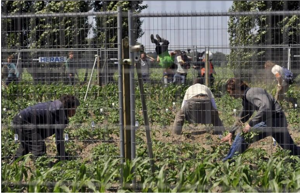
Photo 26: Protestors destroy GMO potato trials in Belgium

While the FLM's direct impact on the public acceptance of GMO potatoes might be difficult to quantify, it certainly raised awareness about the perceived potential consequences of genetically modified crops. The movement prompted media coverage and public discussions, leading to increased scrutiny of GMOs and their regulatory frameworks. This heightened awareness likely influenced public attitudes toward genetically modified potatoes and other crops.