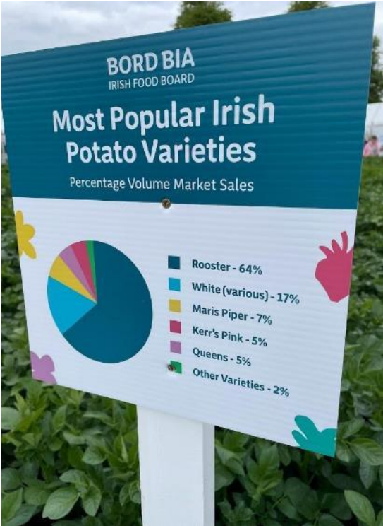
Photo 19: Ireland's Bloom Festival, Agricultural Engagement Signage