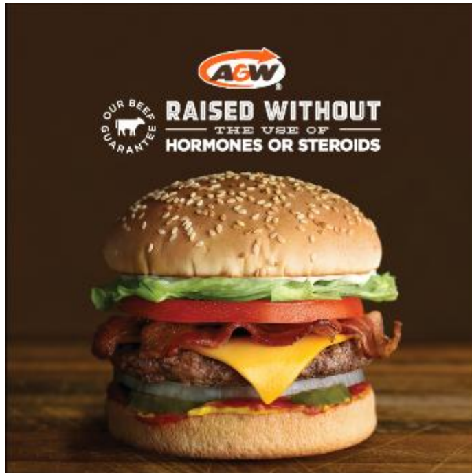
Photo 27: A&W beef ad campaign highlighting no hormones or steroids

With all the food safety regulations in Canada and other developed nations, food is safer than ever, yet people fear what their food might do to them.