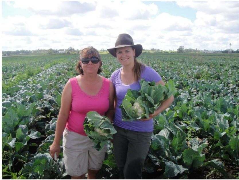
Picture 9: First cauliflower crop in the Lockyer Valley after floods, Queensland, Australia

When having a positive outlook in life we focus on the good things, believe that life's hardships make us stronger and teach us the true value of perseverance.