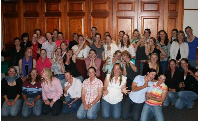
Picture 8: Women in the Pastoral Industry Career Workshop, Queensland, Australia

As a guest speaker at this workshop, I encouraged them to have confidence in themselves and if there was anything they wanted to achieve, even if it's never been done before, to go for it and just do it. Perseverance will lead to accomplishments.