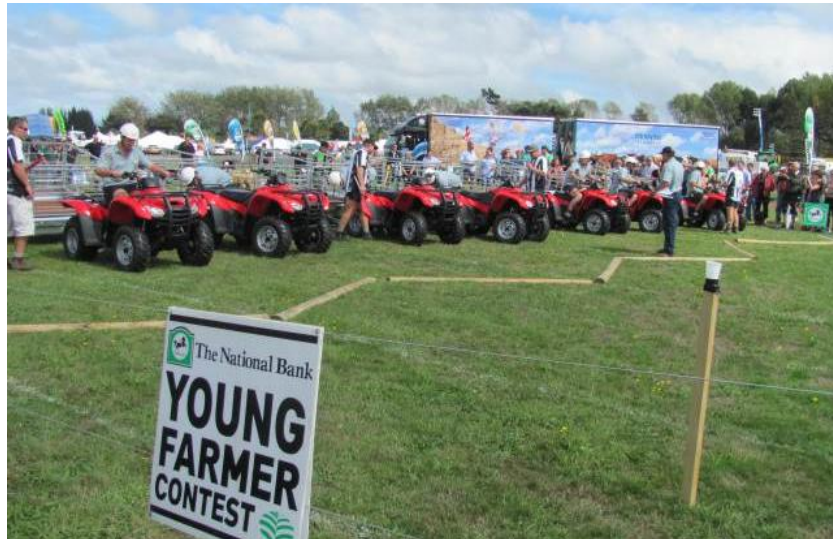
Picture 4: Regional Final Young Farmer Contest at Field Days in Fielding, New Zealand

Operating a successful youth organisation takes dedication and drive. The support of local communities, industry members and governments are crucial. Engaging the general public is a part of the experience and as we move forward I believe that learning how to effectively and creatively communicate is becoming increasingly important.