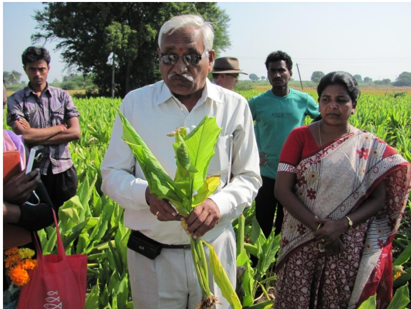
Picture 1: Turmeric field natural pest management demonstration, Warangal District, India

It was nice to see that progress is being made, however there is lots to be done.