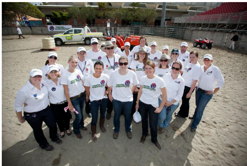
Picture 3: Youth in Ag Day Ambassadors at the Sydney Royal Easter Show, NSW, Australia